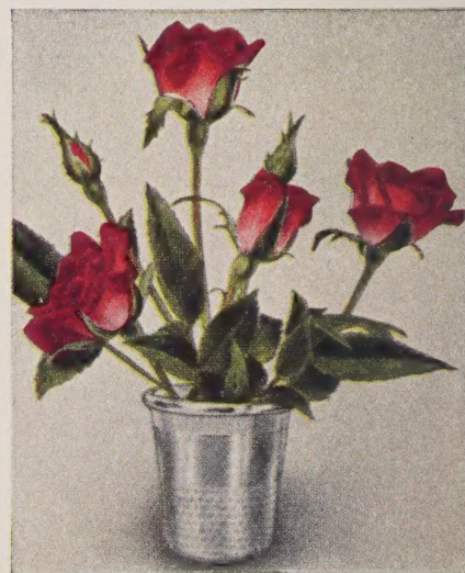
DWARF ROSE, TOM THUMB (Patent No. 169, Conard-Pyle Co.)